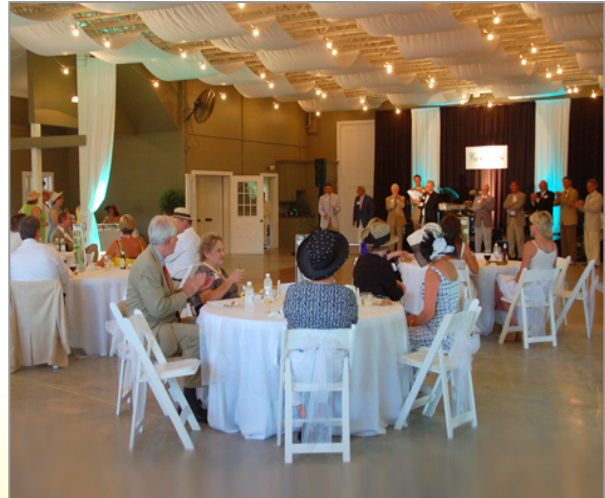
The leadership of Grow Greater Dalton spoke to guests at the kickoff celebration held at Walnut Hill Farm.

G row Greater Dalton is at its heart a world class economic development and community visioning initiative that will transform this community over the next four years. It will dramatically accelerate job creation and economic growth. An aggressive and highly effective marketing campaign will bring dramatic change to the way others, particularly job creators, look at Dalton and Whitfield County. At least as important as luring new businesses will be working in concert with existing businesses to ensure that they will expand here first when growth opportunities emerge. Oversight and governance of Grow Greater Dalton will be in the hands of an Investors Council who will hold all those involved to account for every penny spent and every job promised.